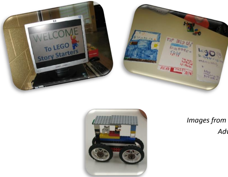
Images from Lego Story Starter Adventures

Course codes are the numbers in front of the titles. Register using the codes instead of the full titles.