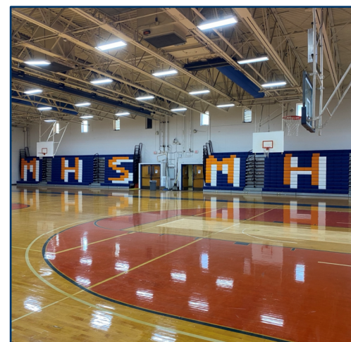
Existing Maury Gym