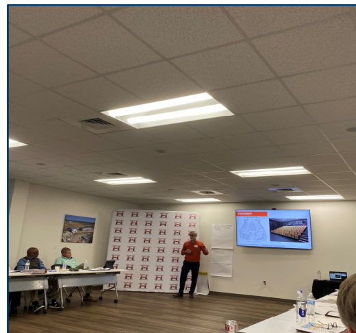
Draft Program Review Meeting