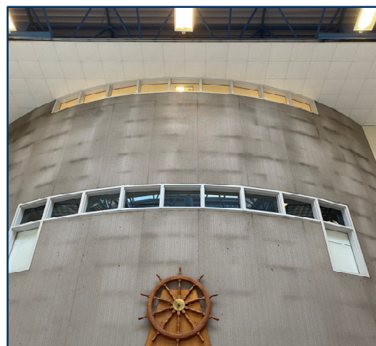
Existing Maury Interior