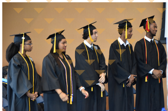
TRIO Upward Bound Program TRIO Upward Bound Program is funded by the Federal Government through the U. S. Department of Education, Washington, D.C. 20202.

www.odu.edu/partnerships/community/programs/upwardbound